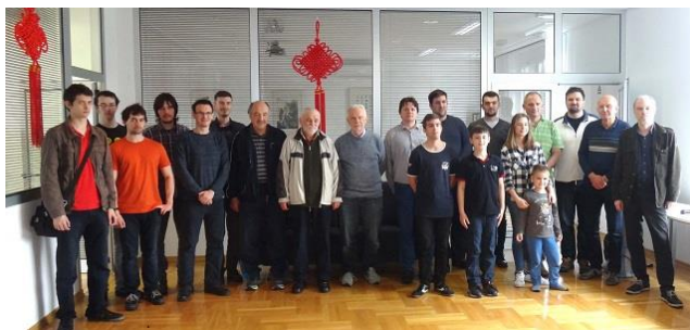
Participants of the Croatian Open Championship 2016