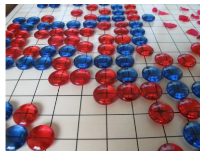
“Flower” stones of red and blue colors